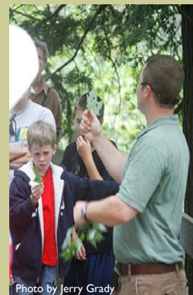
Photographs from nature walks and other local scenic/wildlife pictures can be seen at www.watershedwildlife.com